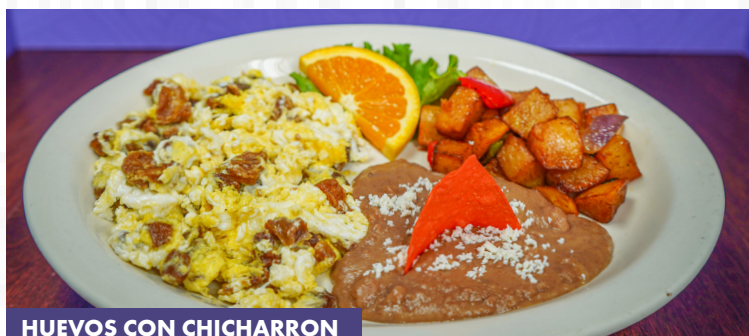
HUEVOS CON CHICHARRON

Pieces of fried pork with scrambled eggs, served with potato tips and refried beans. 11.99